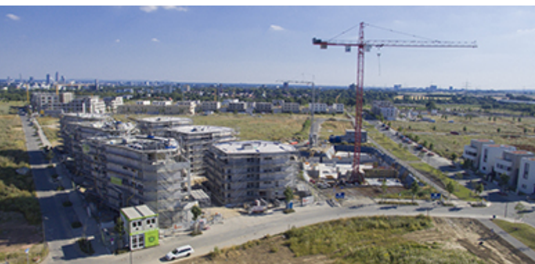
Austrian CA Immobilien was a strong contributor to the fund's performance in the quarter.

The worst contributor in the fund was Japanese Mitsui Fudosan, not due to any company specific reason, but rather to a generally weak real estate market and a weak yen. SL Green was also a detractor on the back of continued fears about the rental growth in Manhattan. The US REIT segment also progressed slowly on fears of higher and faster than expected interest rate hikes, in addition to a weak USD.