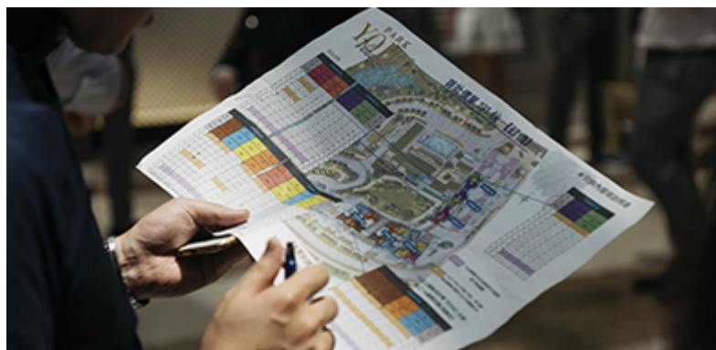
Hong Kong based Sun Hung Kai Properties is a new position in the fund.