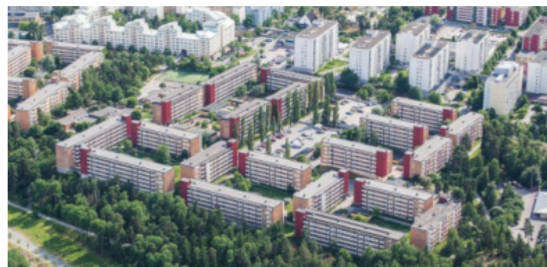
The Swedish real estate space rebounded during the quarter and D Carnegie was one of the top performers in Q3.