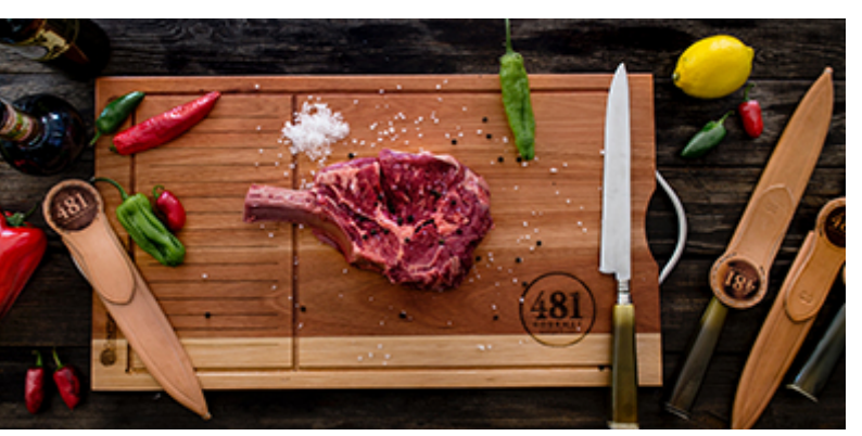
Another positive development, in an otherwise weak Brazilian market, came Mahindra has been a strong performer recently riding the strong rural from Brazil's second largest beef processor Marfrig.

Another positive development, in an otherwise weak Brazilian market, came from Brazil's second largest beef processor Marfrig which seems close to concluding the sale of their food services subsidiary Keystone. China Shineway, a leading supplier of traditional Chinese medicine,