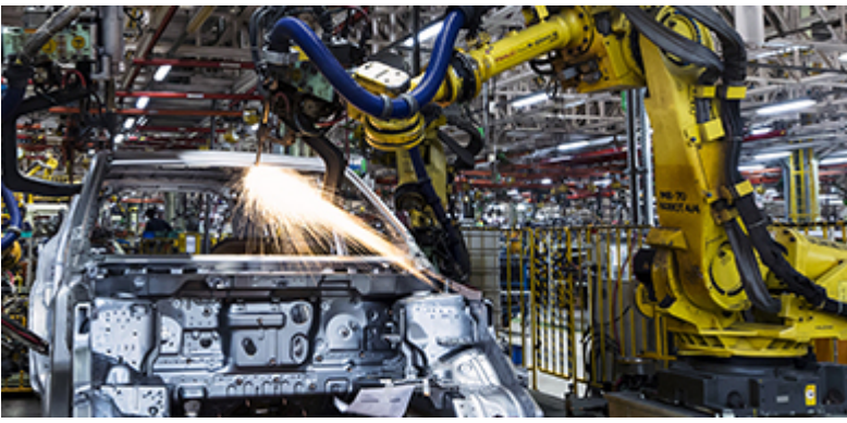
recovery underway in India.

Our focus on increased sell discipline in the portfolio can also be seen through our exit of Bollore. Bollore's African holdings came in the spotlight after Vincent Bollore was placed under formal investigation relating to suspected bribery of foreign officials in Africa through one of their previous subsidiaries. We are in no position to judge whether rules have been broken, but a long drawn out investigation is likely to put a lid on the share price and we decided to move on due to heightened governance risk. We also exited Kinnevik at levels close to our price target.